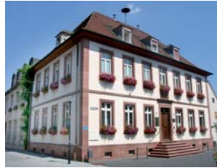
Town Hall on the Market Square

aristocrats and patrician families had many fine houses built, mainly along the Amtsgasse and on the Market Square, where they still define the town's profile today.