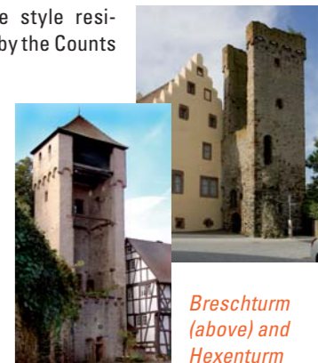
Breschturm (above) and Hexenturm

At the flowering of the town's development the