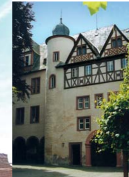
Inner courtyard of the castle

A large wooded area extends north to Rodgau and east to the border with the state of Bavaria and makes Babenhausen one of the most densely wooded towns in the state of Hesse. To the south the municipal area reaches as far as the foothills of the Odenwald. On the west, agricultural areas vie with partly protected wetlands and with quarry ponds. Babenhausen is a railway junction on the Darmstadt-Aschaffenburg and Hanau-Odenwald lines. Motorways and their approach roads take you close to the municipal area.